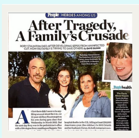
People Magazine continues its' coverage of the Foundation

Our Fly to Fight Sepsis campaign with Roche Diagnostics has reached a million people since launching in September! The Signs of Sepsis video was viewed 375,000 times. We can't wait to lift this campaign to even greater heights in 2019!