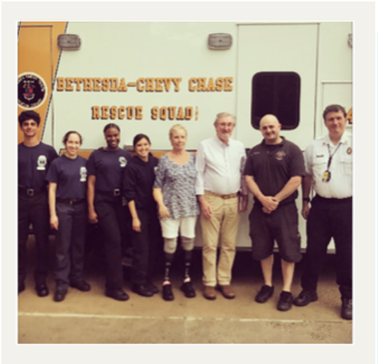
National Family Council on Sepsis, Bethesda, MD