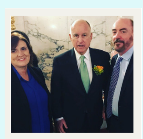
(With Governor Jerry Brown of California)