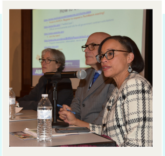
National Forum on Sepsis New York, NY