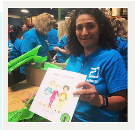
Bernie's Book Bank Chicago, IL