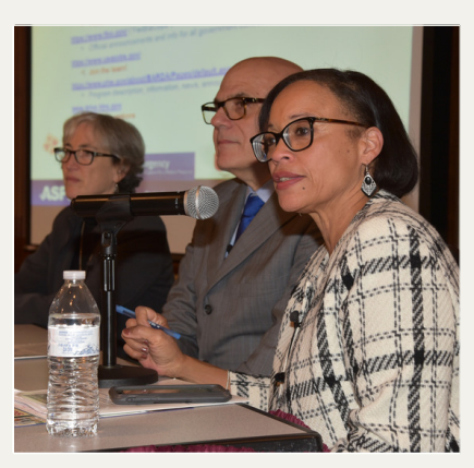
National Forum on Sepsis, New York

We brought together leaders from government, healthcare, patient safety, and biotech for our biggest National Forum on Sepsis to date! Leaders from CDC, CMS, New York State, and leading academic institutions reported on new research and the impact of public policies and agreed that accelerated action to address the sepsis crisis was vital.